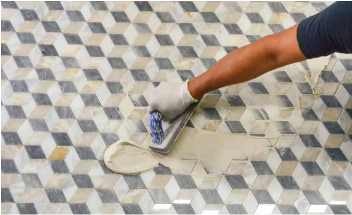
Step 8 Apply grout with a rubber grout float, forcing grout into joints until full. Remove excess grout with edge of float.