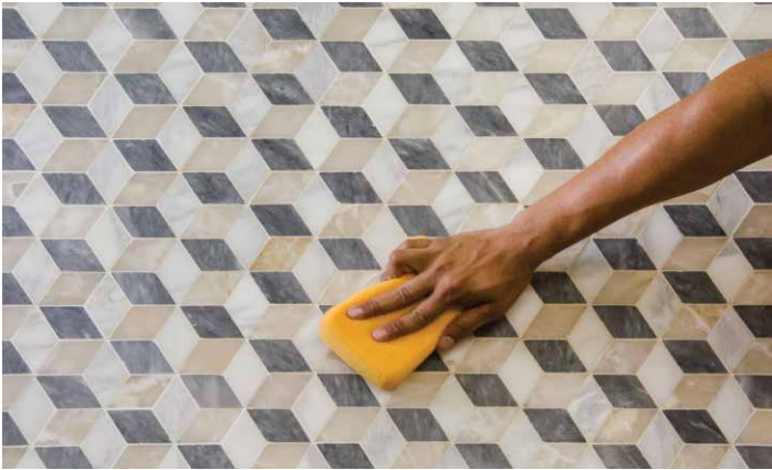
Step 9 Allow grout to set until firm and smooth finish with a damp sponge. After approximately 2 hours, remove grout haze with a lightly damp sponge.