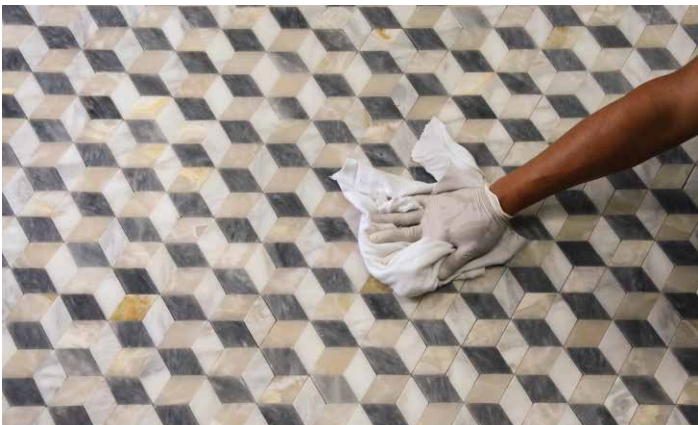
Step 7 Remove excess with a clean white cloth. Allow cure time per manufacturer's instructions.