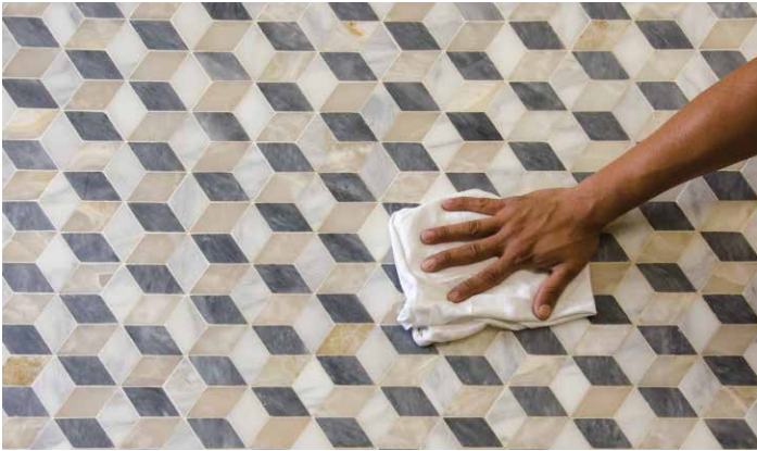
Step 10 For final removal of grout haze, polish with a clean, soft, white cloth. If tape residue remains on material, dampen a cloth with warm water and gently rub the material in small, circular motions. If residue remains, repeat process.